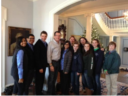
Students take a break from their hard work to pose with Governor Malloy