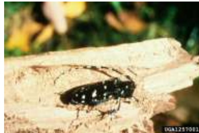
The Asian Longhorned Beetle