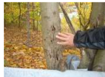
ALB Exit Holes