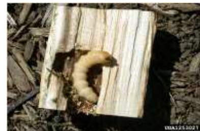
Larval Asian Longhorned Beetle