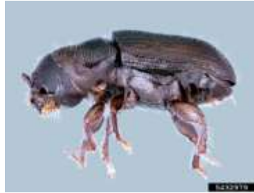
Southern Pine Beetle