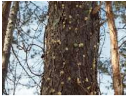
Trunk with Pitch Tube