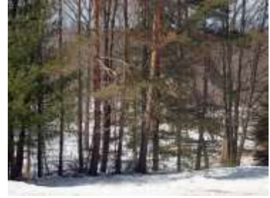
Infested Scotch Pine