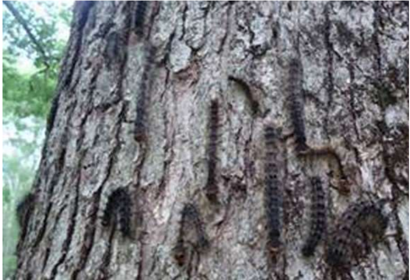
Gypsy moth caterpillars on an oak tree in Bethany.

Widespread gypsy moth activity and some tree defoliation has been detected this summer across areas of Connecticut, according to the Connecticut Agricultural Experiment Station (CAES).